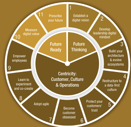
The Ticking Clock ® Model

The workshop addresses the different components of becoming a digitally driven organization and why it's critical to be future fit. It demonstrates the three strategic stages and 11 steps for becoming digitally driven—called The Ticking Clock ® Model. The model, illustrated here, provides a platform to start from and a place to focus.